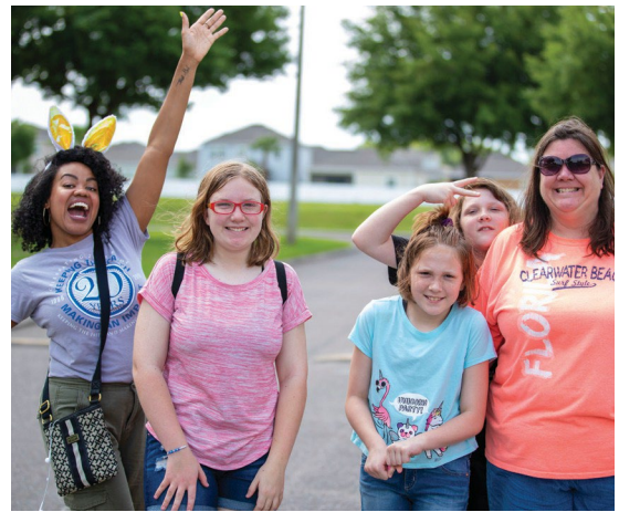
IMPACT KIDS EGG HUNT