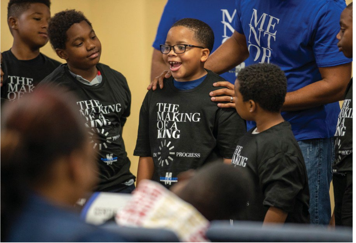
MANHOOD MENTERSHIP ACADEMY