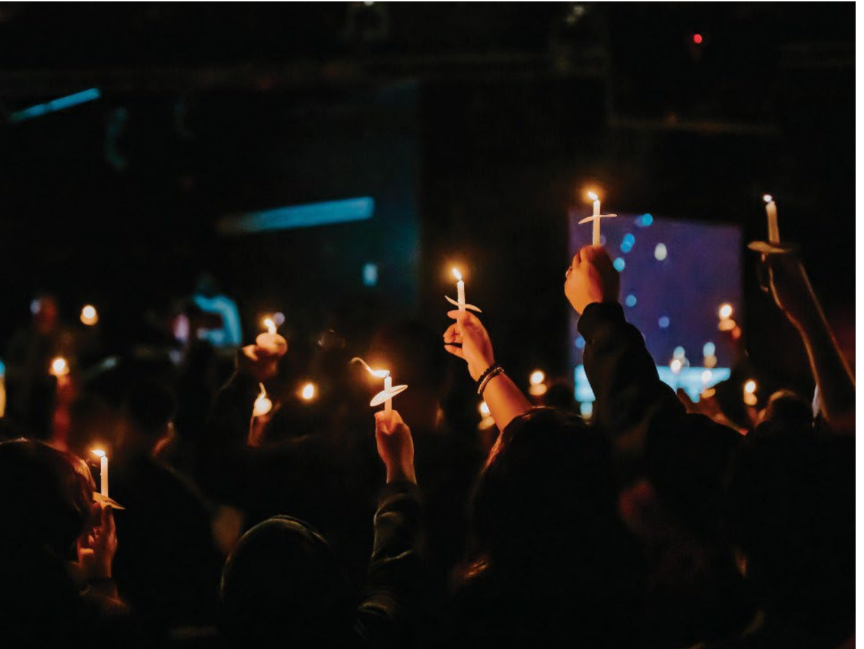
CHRISTMAS AT IMPACT