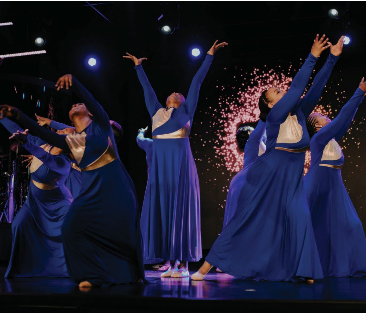
IMPACT WORSHIP ARTS