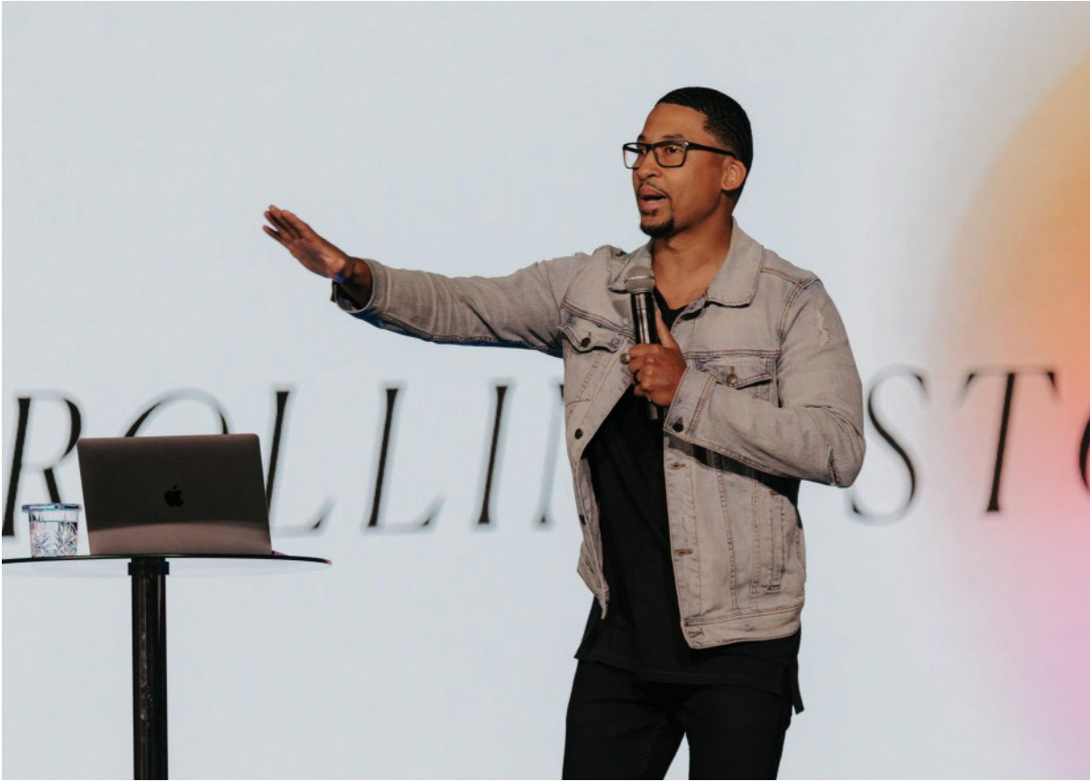
IMPACT CHURCH ORLANDO